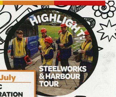
HIGHLIGHT STEELWORKS & HARBOUR TOUR